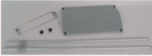
Base, 2 telescopic poles, 1 top holding bracket and 2 thumb screws.