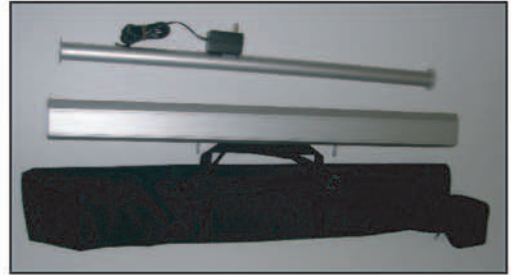
Motorized Revolving Unit, Bottom weighted roller, Carry Bag and Transformer.